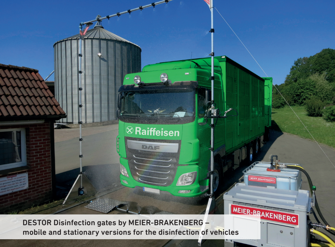
DESTOR Disinfection gates by MEIER-BRAKENBERG – mobile and stationary versions for the disinfection of vehicles